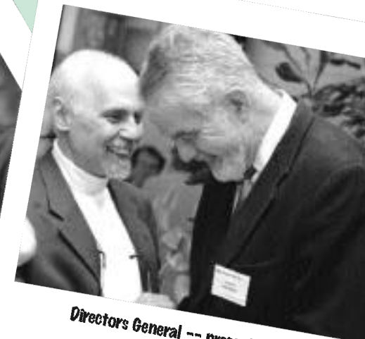
Directors General -- present and past