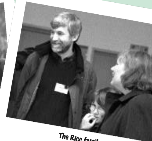
The Rice family